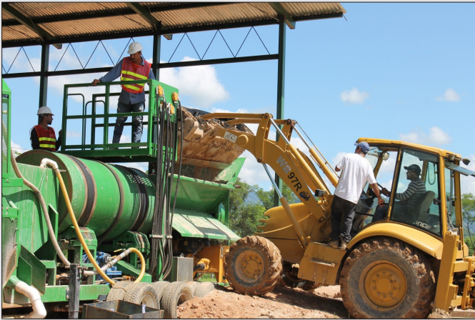
Figure 2. First stage in the SSGM tailing reclaiming process feasibility project, initial particle size screening.