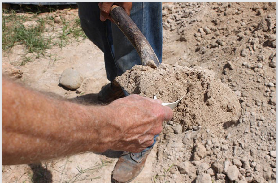
Figure 4. Incremental sampling from each shovel used to transport all original lots, see Figure 3.

After processing all primary tailings in the manner illustrated, quantitative analysis was carried out on a selected set of seven primary samples (project financing was at the time of the analysis also at a decidedly “barefoot” level). These samples were not easy to process, however, as they were all slurries and with very different Au and Hg contents. Slurry sampling is not easy under any circumstance, but especially not when