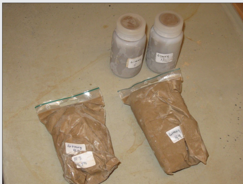
Figure 6. Two types of slurry sample containers as received from Nicaragua, plastic bottles and bags. The photo shows the frozen versions after 24 h in a freezer at –16°C, ready for sub-sampling, see Figures 7–8.

A novel twist had to be devised: after vigorous and extensive mixing, the entire 1–2 kg slurry samples, which came in tightly sealed but otherwise conventional plastic bottles or bags, were stored in a freezer (–16°C) for 24 h, sufficient for the entire content to freeze solid. The “splitting” was then effected as a two- or three-step longitudinal sectioning of the solid bottle or bag content, see Figures 7 and 8. In this way any residual segregation affecting the vertical container