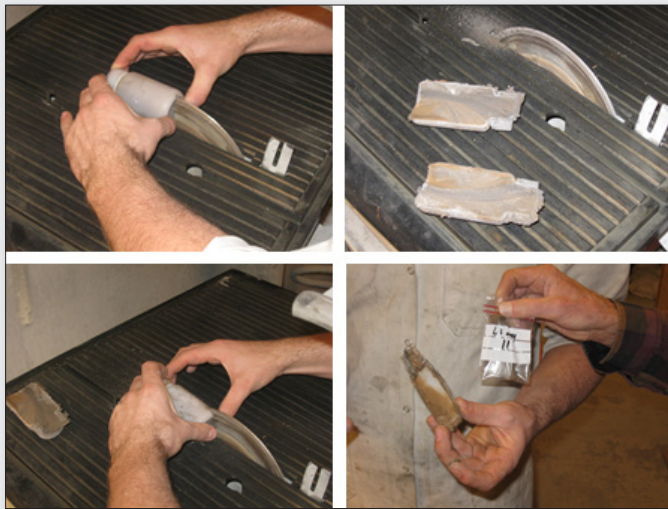
Figure 7. Two-stage mass reduction of frozen sample bottles. First cutting is a 50/50 split, followed by a further slice of one of the randomly selected half cores produced, resulting in a 10–15% final sub-sample mass, which is guaranteed to be representative of the original container content in the vertical dimension irrespective of the degree of possible residual segregation present.