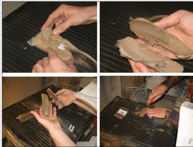
Figure 8. Three-stage mass reduction of frozen sample bag content. All cuts are vertical slices again resulting in a 10–15% final sub-sample mass, which is guaranteed to be representative of the original container content in the vertical dimension irrespective of the degree of residual segregation present.

accordance with TOS’ every principle for representative sampling to a degree only rarely deployed within the geosciences, while at the same time exclusively only relying on manual processes. 7,9 The term “barefoot sampling” appears apt.