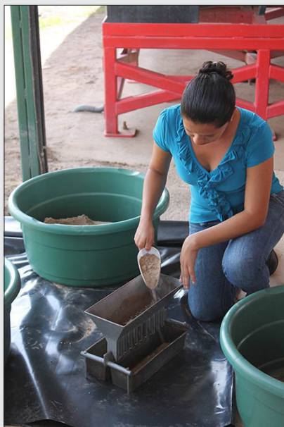
Figure 5. Loading the project riffle splitter (kindly provided by GEUS). Sub-sampling is made effective by the fact that the sample to be split does not need to be split all in one, but can be subjected to riffle-splitting in an intermittent loading process. 7

stringent counter-volatility demands are to be upheld. Also, sub-sampling, although here carried out in a well-equipped laboratory (GEUS, Copenhagen), had to be performed with procedures that potentially can be carried out under the relevant ambient field conditions in Nicaragua.