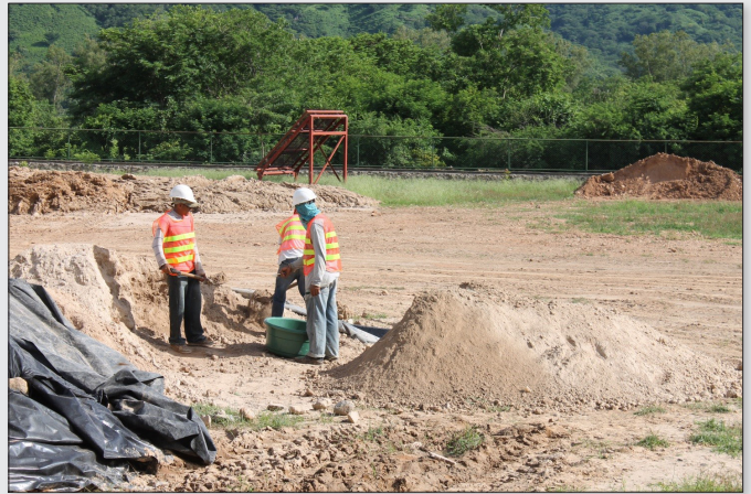
Figure 3. Halfway through the intensive task of moving a complete original lot one shovel at the time, taking great care to extract an increment from each, as detailed in Figure 4.

from each spiral is directed to the next spiral. The light fraction from “Rougher” and “Cleaner” is directed to a centrifuge, termed “Scavenger”. The light material from here is directed to tailings while the heavy fraction is directed to the “Finisher”. The heavy fraction from the “Finisher” is directed to a stack of copper amalgamated plates “Peter plates”, 2 which finally capture the mercury flour and free gold particles to be reclaimed. Figure 2 shows the first stage of the full feasibility study (drum loading for initial particle size screening). Below we are exclusively interested the critical primary sampling from the original tailings: how to get a documentable representative analytical estimate of the average gold grade?