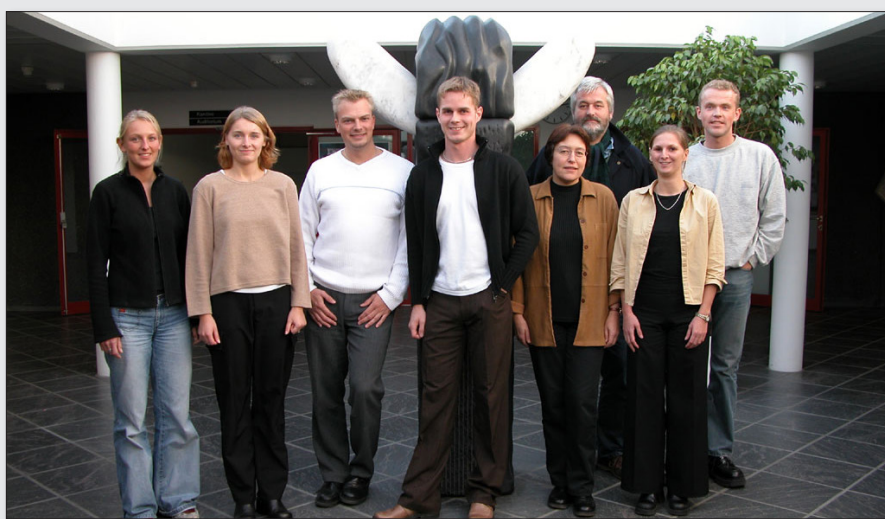
Historical comparison: Another small organising committee: WCSB1, 19–22 August 2003, Esbjerg, Denmark.