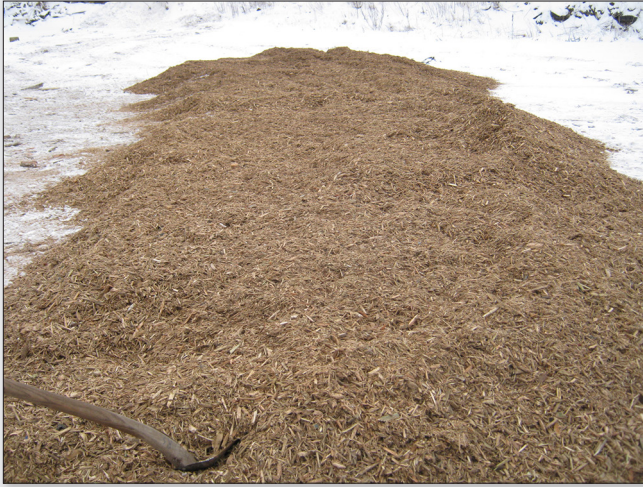
Figure 7. The composite secondary sample lot flattened to a maximum height of 50cm. 50 increments were taken at randomly selected locations and depths (using a shovel), making up the final composite sample of 10kg.

It could probably always be discussed whether the number and size of increments in relation to “particle size” are adequate. In this case, they were considered appropriate based on experience, knowledge from EN 14780 1 and a sound judgement on site.