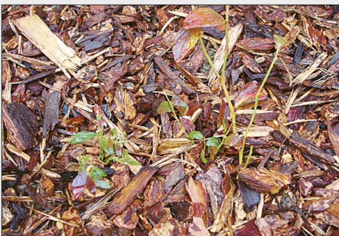
Figure 2. Typical fresh wood chips characterised by significant proportion of bark and foliage. Grab-sampling of this type of material will give rise to severe sampling errors (FSE + GSE) if not guided by proper TOS-compliant principles. Add hereto Incorrect Sampling Errors (ISE) if not considered.

The critical question obviously is whether the biomass field can live with this kind of uncertainty. Most of the scientific endeavours are designed toward understanding combustion and gasification processes and not toward obtaining absolute and truthful values representing the original feedstock fuel. The interest is most often to understand how certain elements behave during thermal conversion. The answers that we are seeking are thus typically relative to specific processes and not absolute with respect to original lot materials. Often secondary sampling from a primary sample (which may be more-or-less representative with respect to the primary lot) appears to provide an acceptable basis for this kind of specific studies, allowing us to gain insight