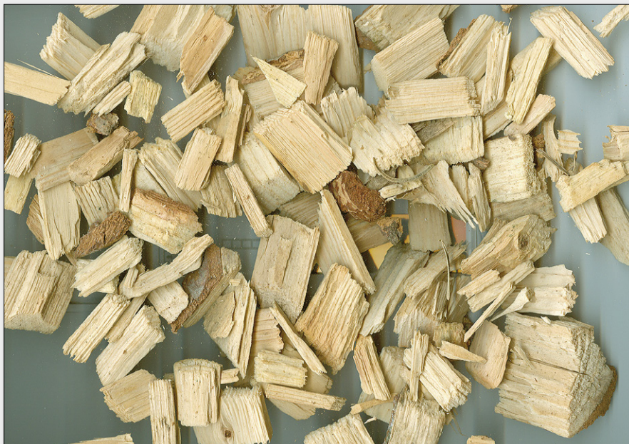
Figure 1. Air dried wood chips used in the original study. Largest shards are approximately 1 inch (3 cm) in length. Although seemingly of uniform composition, the fuel actually consists of a mix of white fir and ponderosa pine. Grab-sampling of the pristine material will obviously give rise to severe sampling errors (FSE + GSE) if not guided by proper TOS-compliant principles, possibly aggravated by using significantly too small sample masses.

to attribute the highly diverse analytical results to analytical problems only. In this context it is particularly revealing that when the two different laboratories analyse the same ash, relatively consistent results were obtained.