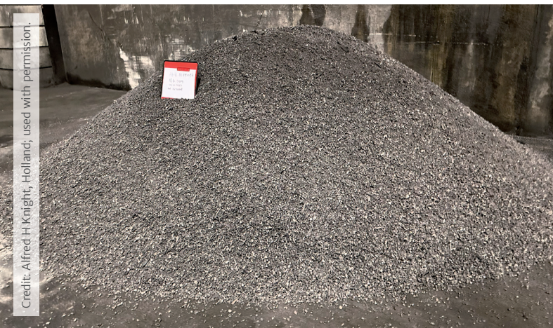
Fig. 1: Typical heterogeneity manifestation of a 25-tonne lot shipment of IBA-HNF. Note how larger particles accumulate at the bottom and smaller particles remain at the top due to segregation during stockpile build-up.

Focusing first on the relationship with the elimination of sampling process bias, it is important to emphasize the persistent heterogeneity in Municipal Solid Waste (MSW) and the resulting untreated Incineration Bottom Ash (IBA).