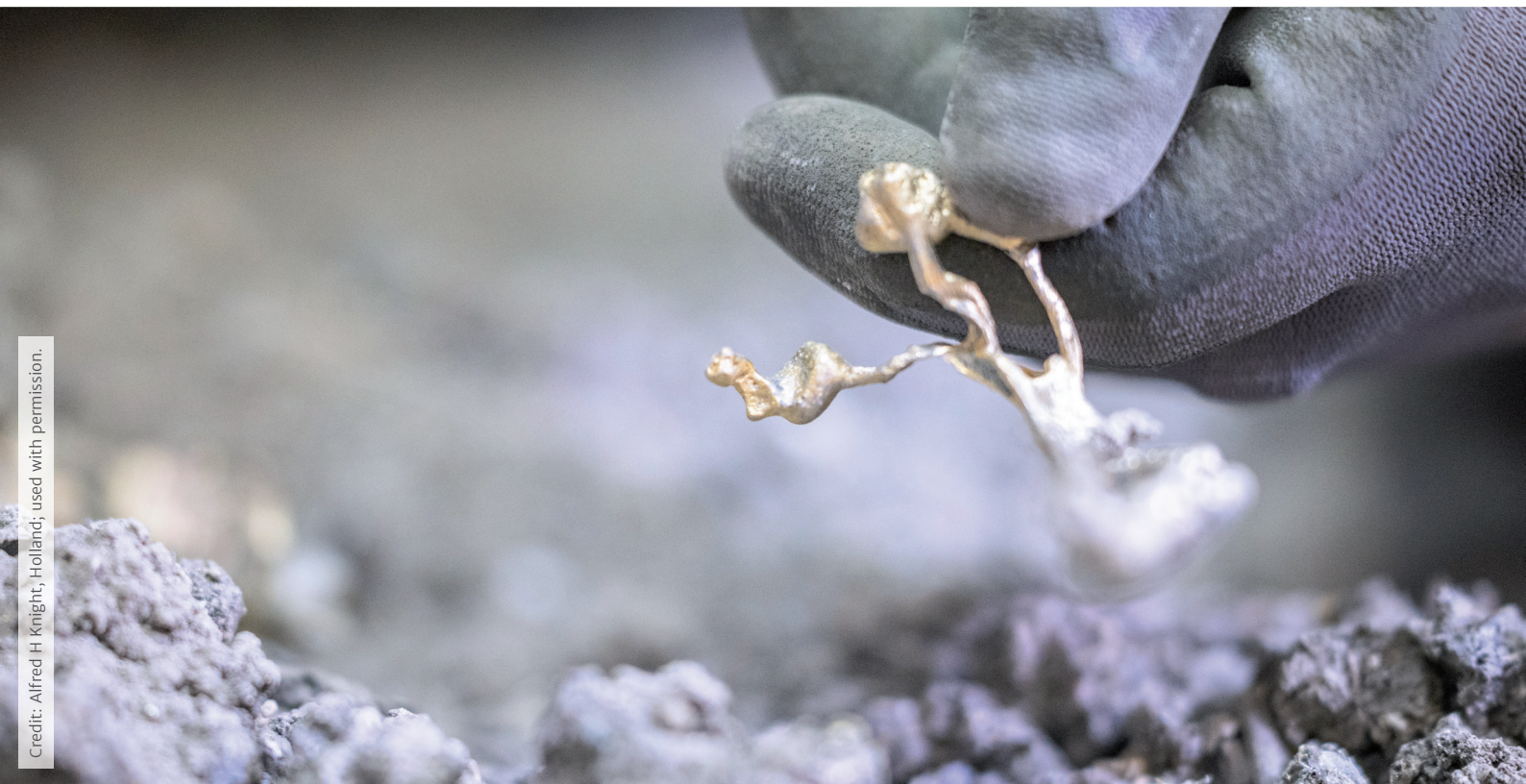
Fig. 2: Close-up photo depicting free gold particle from IBA-HNF material attesting to highly significant heterogeneity at particular scales.

Although IBA-HNF constitutes only 1-4% of untreated IBA by mass, this concentrated product on closer examination reveals phenomena such as grouping, segregation, and nugget effects, which are common in stockpiles of solid bulk particulate materials. The nominal top size of IBA-HNF is 19 mm, and with a moisture content of less than 3%, the material is mostly free-flowing. However, the presence of non-ferrous metals from cables and wires may cause material aggregation, much like yarn forming a ball. Furthermore, during stockpiling operations, larger particles tend to concentrate at the bottom and smaller particles rise to the top (Figure 1).