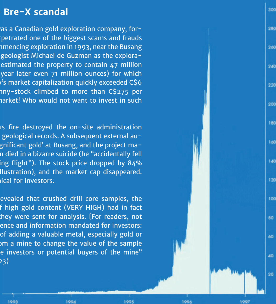
Fig. 1: Value: Now you see it – now you don't. Bre-X stock prices (1994-1997)

A full investigation revealed that crushed drill core samples, the only hard evidence of high gold content (VERY HIGH) had in fact been 'salted' before they were sent for analysis. [For readers, not familiar with the evidence and information mandated for investors: "Salting: the process of adding a valuable metal, especially gold or silver, to a sample from a mine to change the value of the sample with intent to deceive investors or potential buyers of the mine" (Bre-X, Wikipedia,2023)